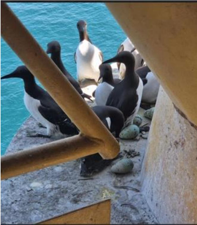
Figure 3.1: Guillemots attending eggs on an offshore installation in the southern North Sea in 2023.