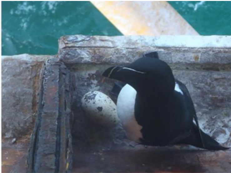
Figure 3.2: A razorbill attending an egg on an offshore installation in the southern North Sea (Ørsted, 2022)